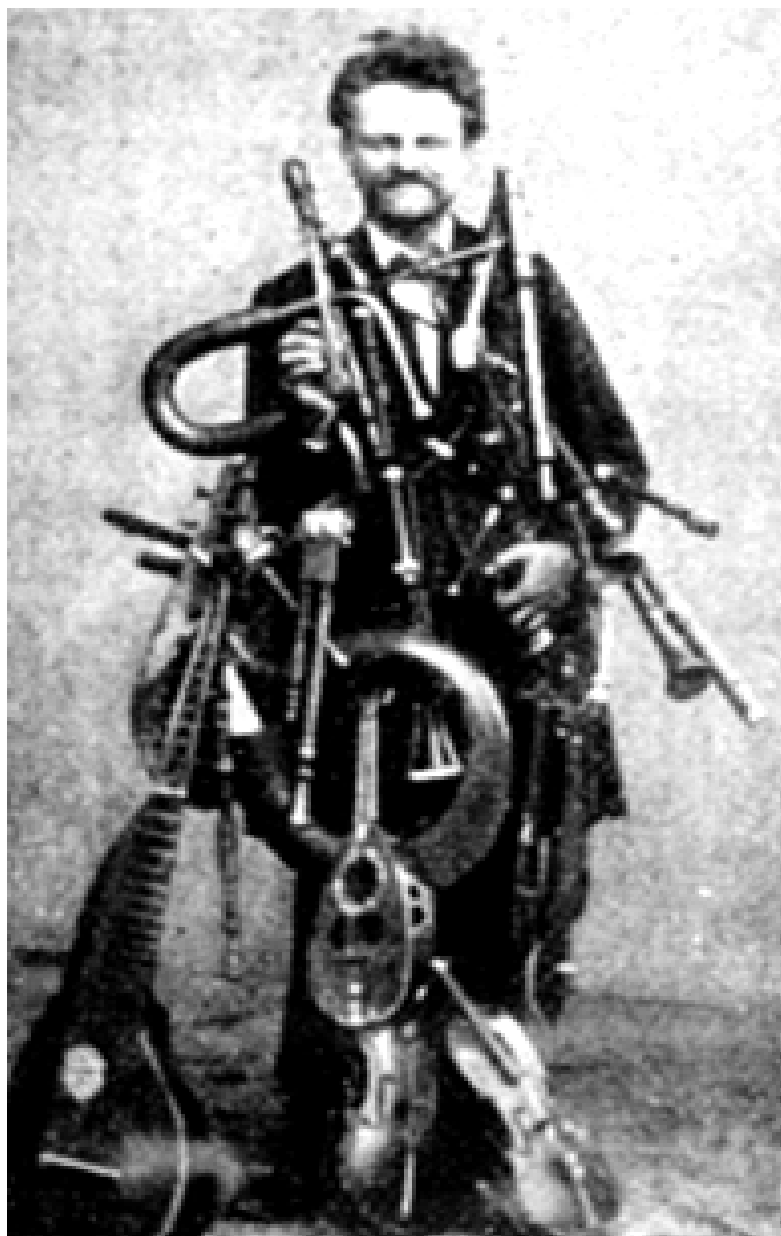
Do you recognise this youthful 'MAN OF ALL MUSIC'?